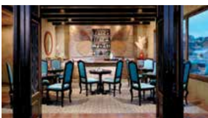
Sip on a moytelek (a riff on a mojito with pear vodka) at the Petit Ermitage’s Butterfly Bar.

BOOKED? Try the Sunset Marquis, just off the Sunset Strip, where Neil Diamond used to perform by the pool to pay his bill. Bruce Springsteen, The Clash and Blondie are all past guests who have made themselves comfortable, too (sunsetmarquis.com).