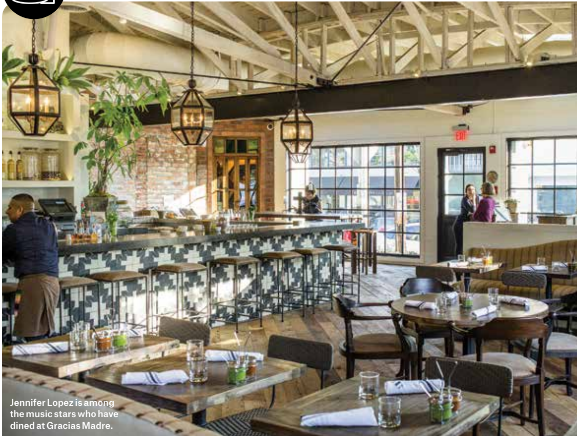
Jennifer Lopez is among the music stars who have dined at Gracias Madre.