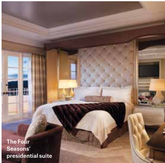
The Four Seasons' presidential suite