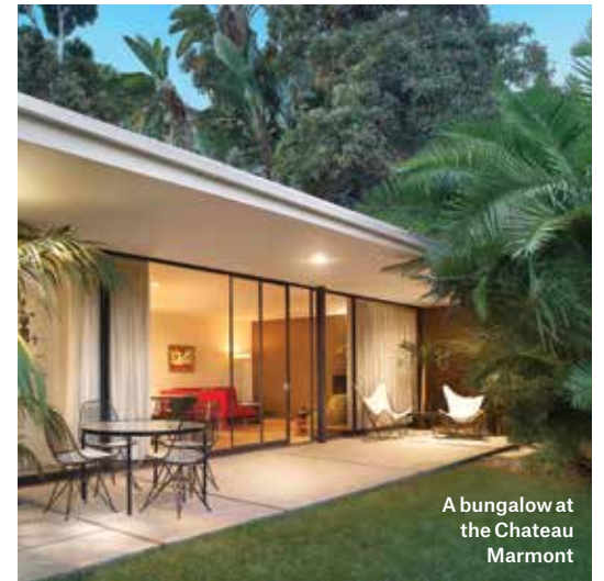
A bungalow at the Chateau Marmont