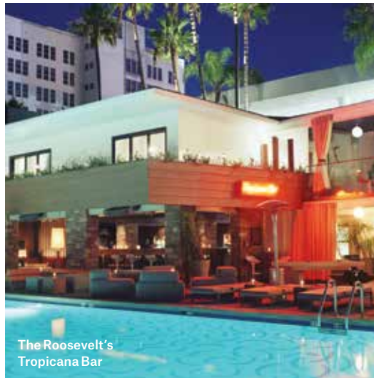
The Roosevelt's Tropicana Bar